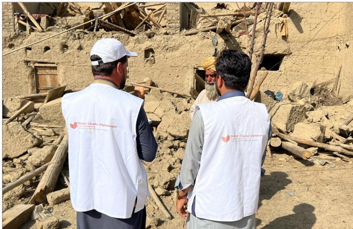
Earthquake in southeastern region - June 2022