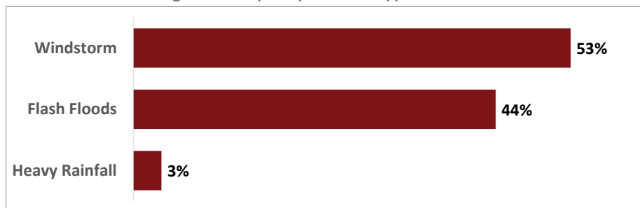
% of Shelters Damaged/Destroyed by Incident Type